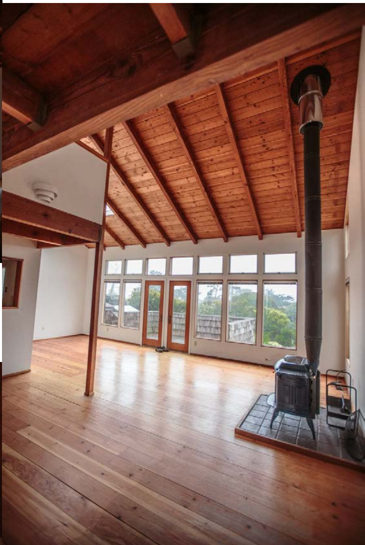
Ocean Views from Livingroom with Fireplace