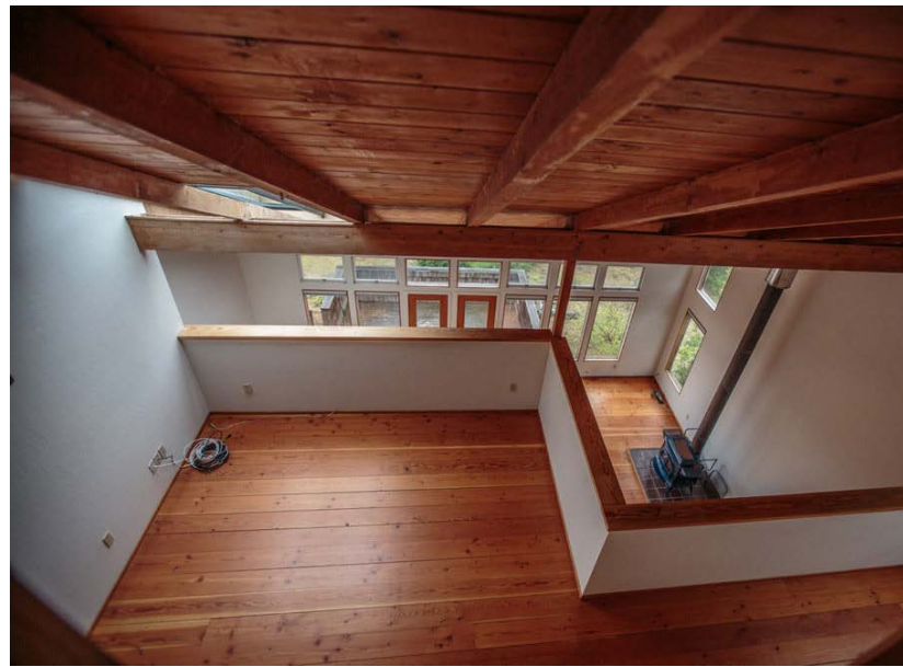
View from 3rd Floor

The information set forth herein has been received by us from sources we believe to be reliable. We do not warrant its accuracy or completeness.