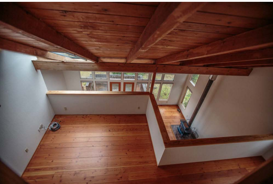
View from Loft