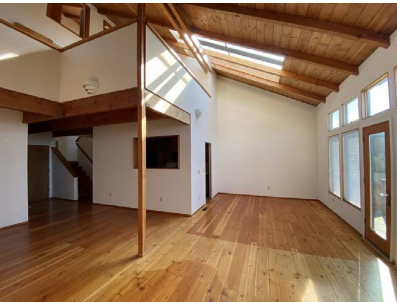
Livingroom Area and Kitchen