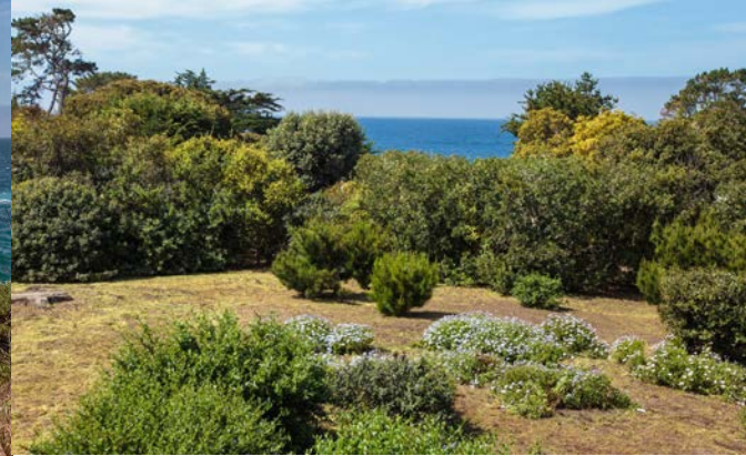
Ocean View from Backyard