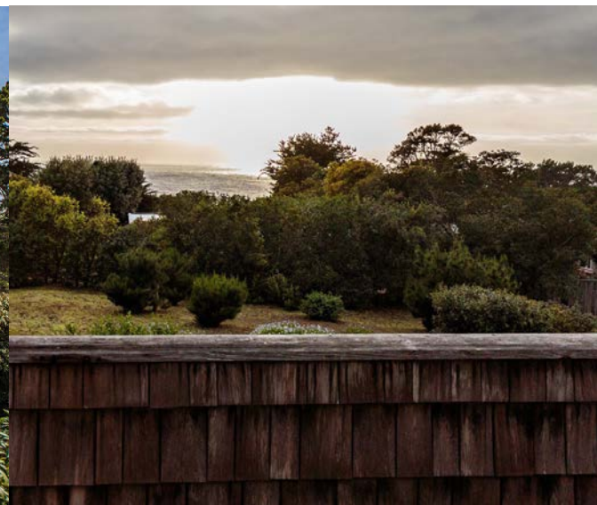
Ocean Sunset View from Backyard

The information set forth herein has been received by us from sources we believe to be reliable. We do not warrant its accuracy or completeness.