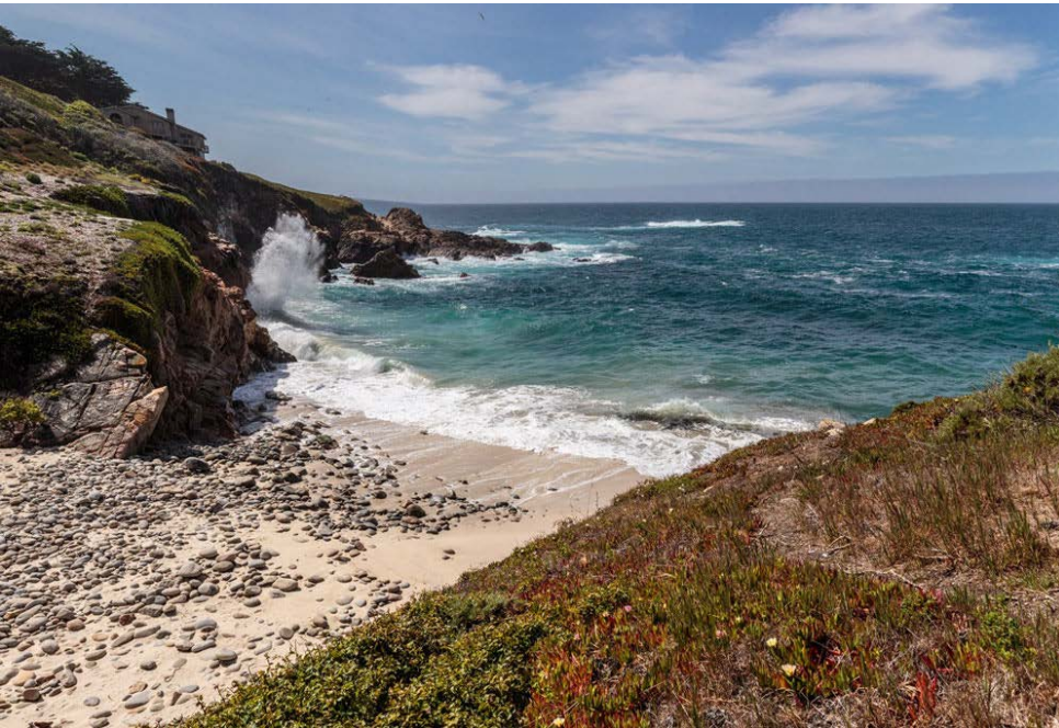
Mal Paso Beach