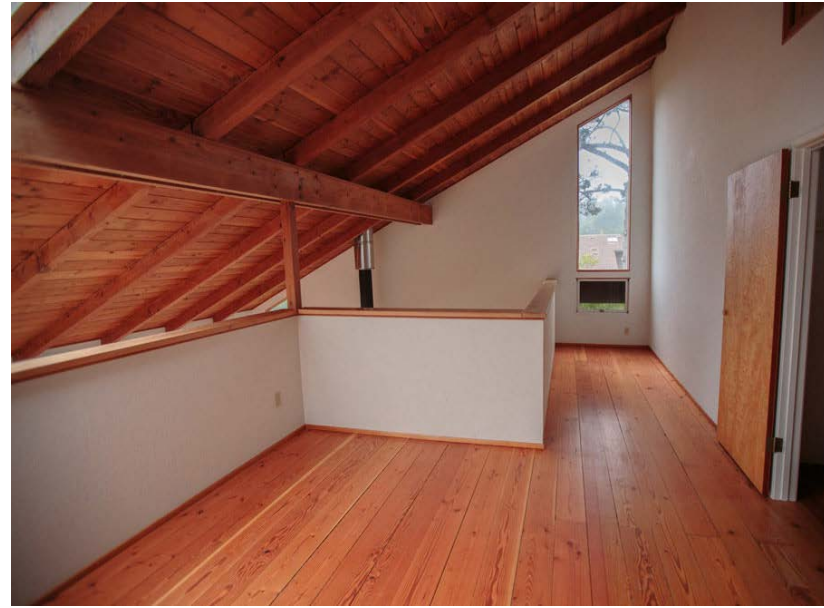
2nd Floor Loft