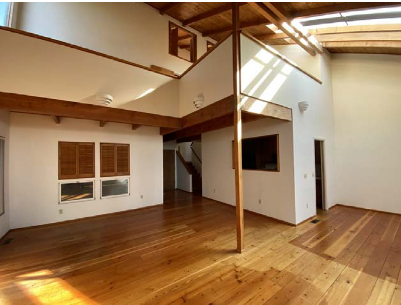
Livingroom and Upstairs Loft